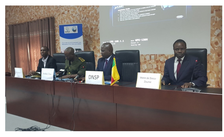
Institutional triggering of Government actors in Benin

Under the Programme d'amélioration de l'accès à l'Assainissement et des Pratiques d'Hygiène en milieu Rural (PAPHyR) project funded by the Global Sanitation Fund, launched in 2015, MCDI has led several institutional triggering