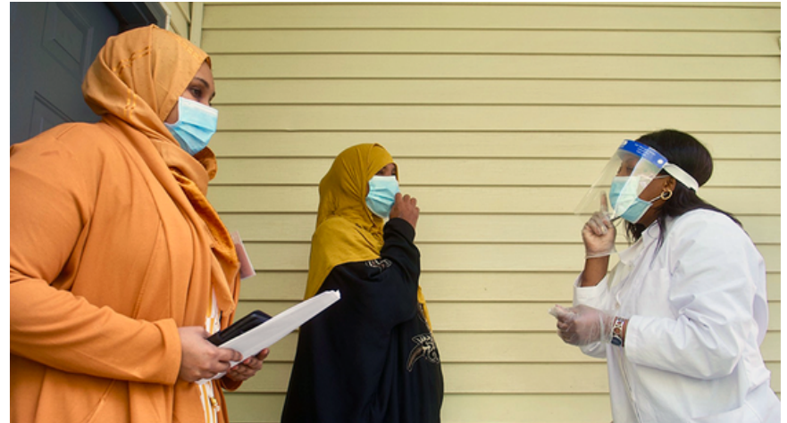
A community health worker in Maine makes a home visit to test for COVID-19 using a nasal swab.

While the behavioral health needs grew in communities across the U.S. and around the world, COVID-19 illuminated a need like never before. MCD is working in rural Maine to improve behavioral health services through education, training, and mentorship programs for future and current health professionals, integrating mental health and substance use disorder. We partner with a network of behavioral health stakeholders to bring practitioners together in order to learn from one another while also building pathways for a new workforce.