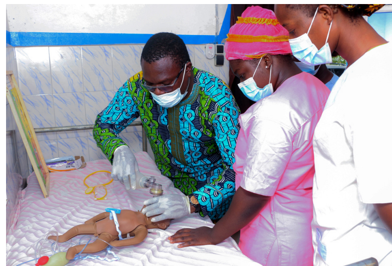
On-site training of private health care providers on pediatric care right after delivery using an infant prop in Benin.