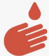
Water, Sanitation, & Hygiene