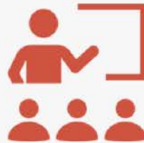
Strengthening Health Systems