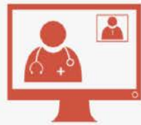
Telehealth & Technology