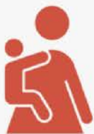
Reproductive, Maternal, Newborn, & Child Health